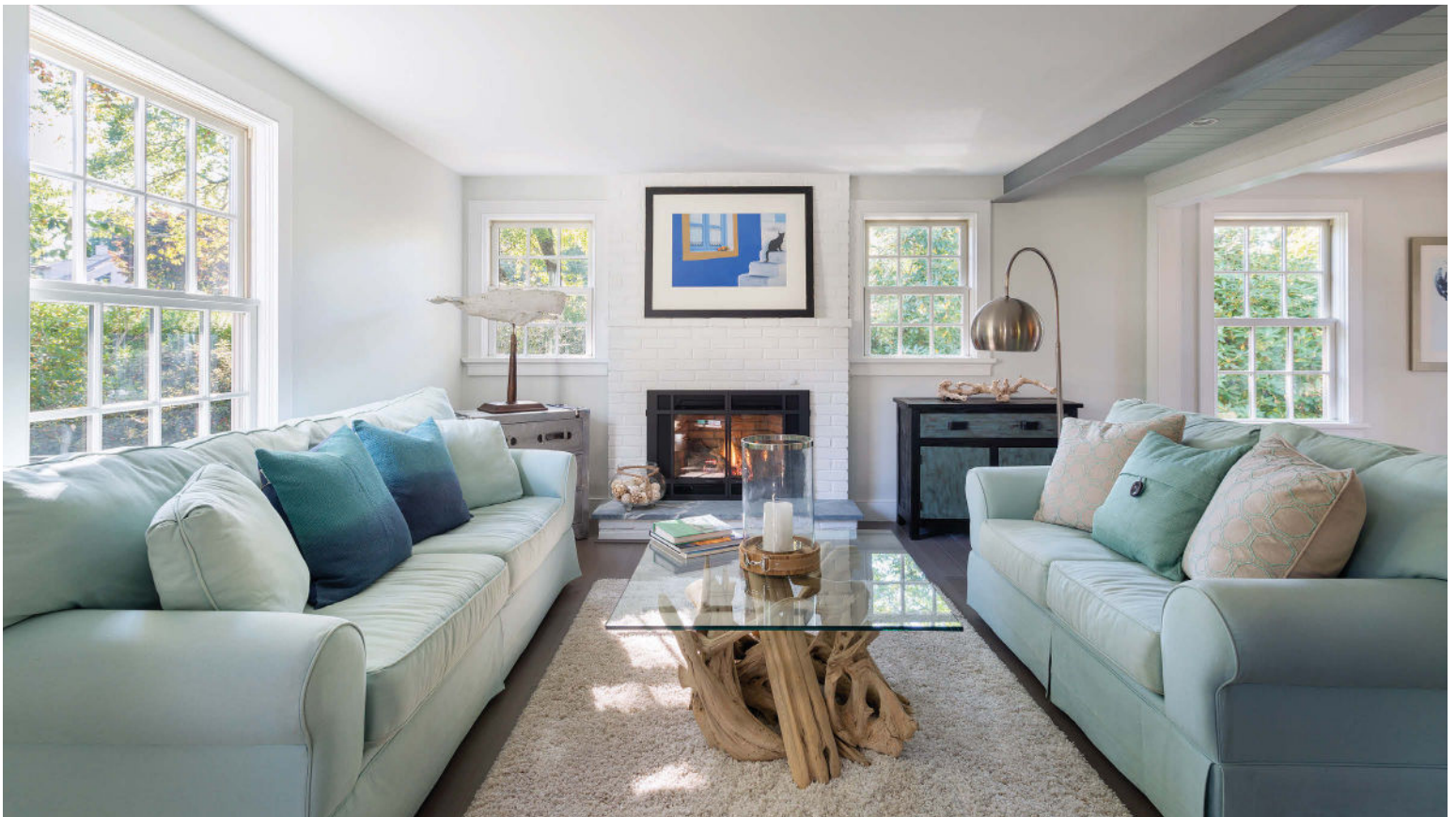
TOP: A wide open floor plan keeps this modest, Narragansett Cape feeling roomy and relaxed. BOTTOM: The white painted brick fireplace surround is reminiscent of the white subway tile in the kitchen, and a new gas insert in the pre-existing fireplace adds interest and warmth. OPPOSITE PAGE: The kitchen design is simple and clean. White subway tiles and cabinets keep the room bright and allow the sea glass green island to pop. Soapstone counters mimic the gray wash of the bamboo floors. The beadboard ceiling, painted a soft blue, is a nice finishing detail.